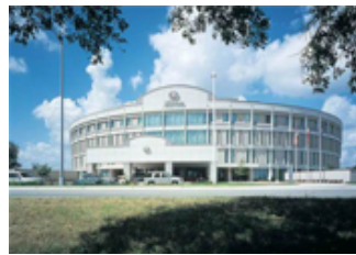
Hilton Austin Airport