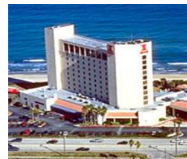
Hilton Melbourne Beach