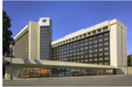
Doubletree Hotel & Executive Meeting Center, Portland Lloyd