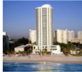
Doubletree Ocean Point Resort & Spa