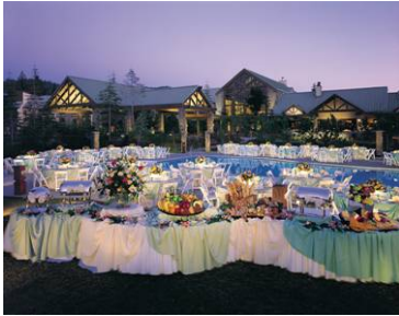
Marriott's Tenaya Lodge at Yosemite