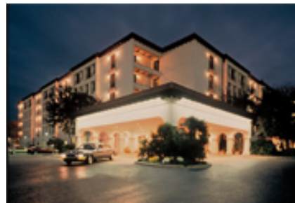
San Antonio Doubletree Hotel