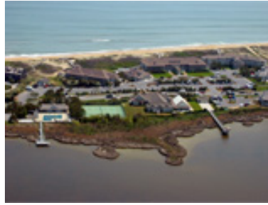
Sanderling Resort & Spa