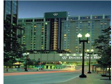
Doubletree Hotel Omaha Downtown