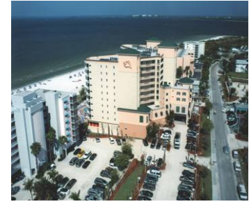
Pink Shell Beach Resort & Spa