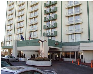
Doubletree Hotel JFK Airport