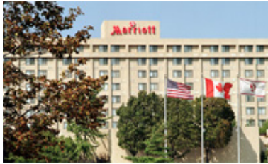
Buffalo Marriott Niagara