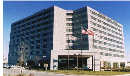
Embassy Suites Southfield