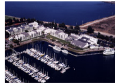
Doubletree Hotel Berkeley Marina