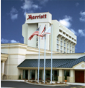
Cleveland Airport Marriott