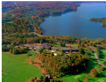
Atwood Lake Resort & Conference Center