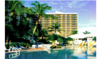
Radisson Suite Beach Resort Marco Island