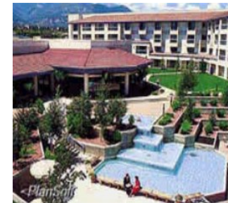
Doubletree Hotel Colorado Springs