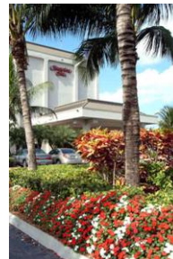
Hampton Inn Miami - Airport West