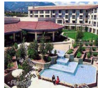
Doubletree Hotel Colorado Springs