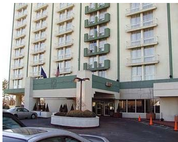
Doubletree Hotel JFK Airport