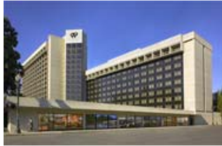
Doubletree Hotel & Executive Meeting Center, Portland Lloyd