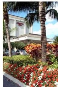
Hampton Inn Miami - Airport West