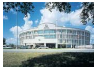
Hilton Austin Airport