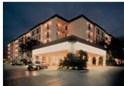
San Antonio Doubletree Hotel