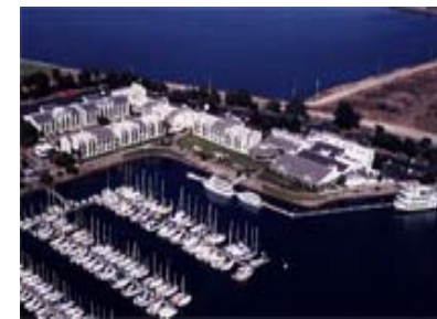
Doubletree Hotel Berkeley Marina