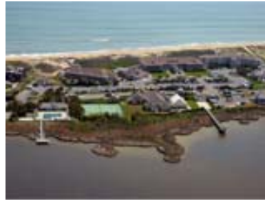
Sanderling Resort & Spa