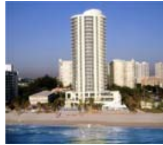
Doubletree Ocean Point Resort & Spa