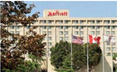
Buffalo Marriott Niagara