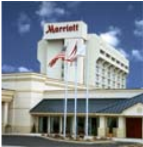
Cleveland Airport Marriott