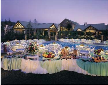
Marriott's Tenaya Lodge at Yosemite