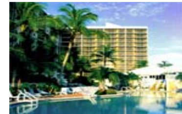
Radisson Suite Beach Resort Marco Island