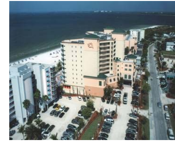
Pink Shell Beach Resort & Spa